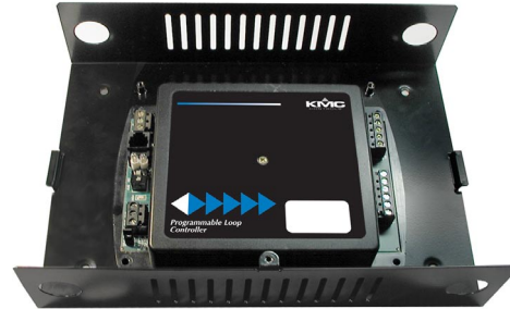
HCO-1102 (shown with a KMD-7401 controller mounted inside)